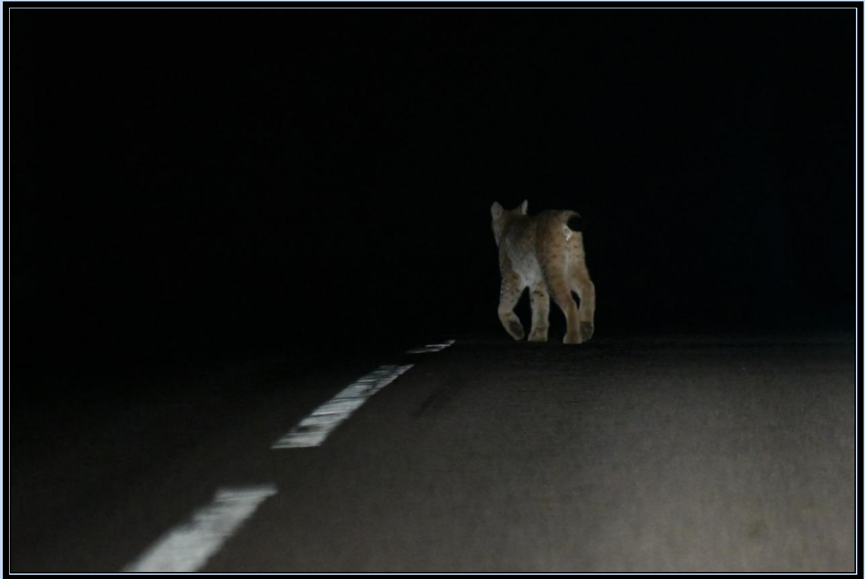
Lynx crossing the road as I followed it for 5 minutes